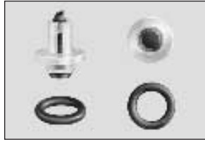
1/2" and 3/4" Poppet Kit