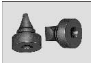
1/2" and 3/4" Bellows Kit