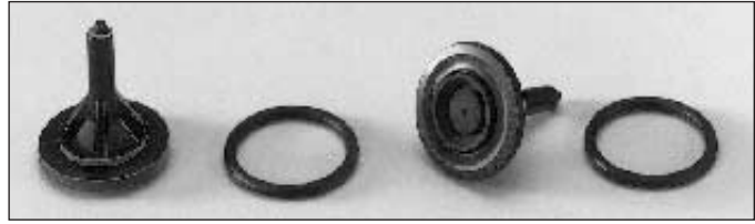
1", 1 1/2" and 2" Poppet Kit

The standard elastomers for the poppet valves and O-rings are EPT/EPDM, Hypalon® and Viton®/Fluoroelastomer. These elastomers have historically been able to handle the vast majority of the applications in which we've been involved. However, Butyl, Hydrin, Kel-F®, Silicone and Nitrile can be supplied for chemicals requiring such materials.