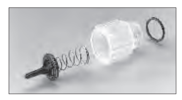
(Valve extension required only on suction port.)

Anti-siphon springs are available to springload poppet valves. Use of these springs produces more positive shutoff of poppet valves and permits use of the pump where there is a positive pressure on the suction side. Available for the 1", 1½", and 2" models. To order, select the proper spring material and O-ring by referring to the Chemical Resistance Section. The appropriate kit can then be chosen based on the blow-off pressure (PSI) required.